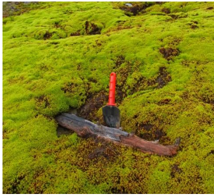
Pinus, Njulla, 1005 m a.s.l.