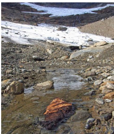
Betula, Tärnaglaciären, 1070 m a.s.l.