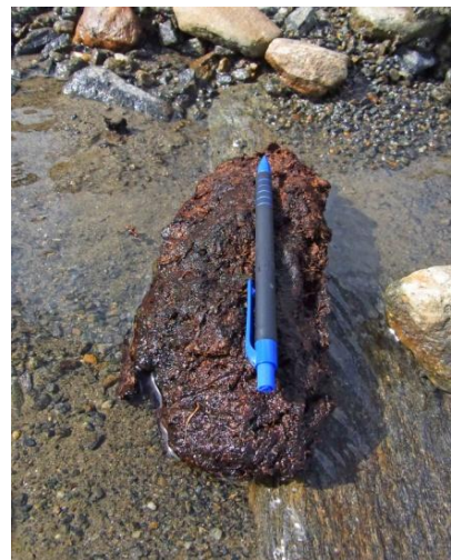
Peat cake, Tärnaglaciären, 1070 m a.s.l.