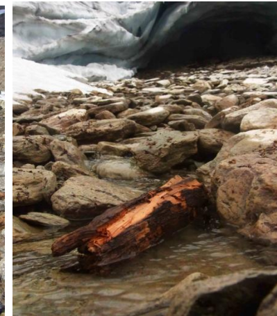
Betula, Kåppasglaciären, 1027 m a.s.l.