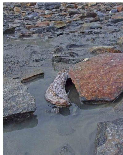
Pinus, Ö. Syterglaciären, 1190 m a.s.l.