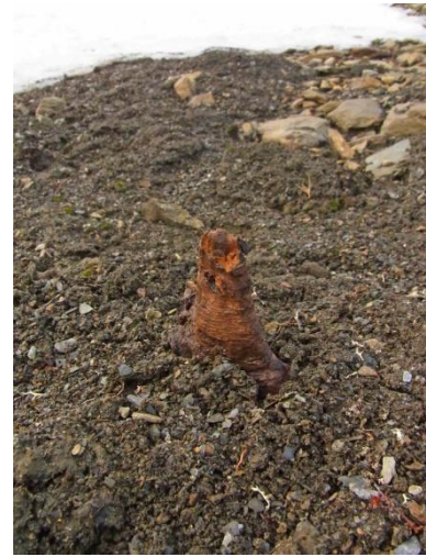
Betula, Låktatjåkka, 974 m a.s.l.