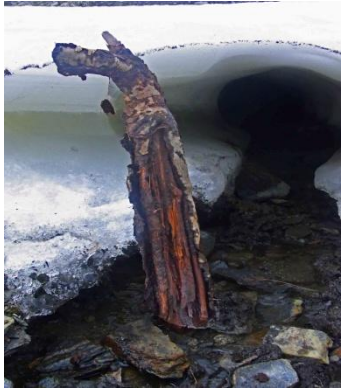
Betula, Njulla, 1025 m a.s.l.