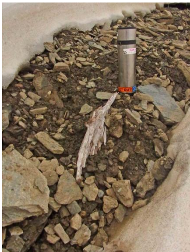
Pinus, Slåttatjåkka, 1087 m a.s.l.