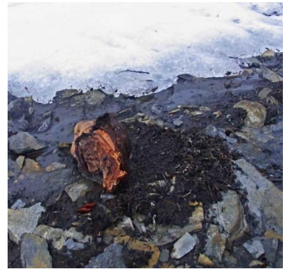
Betula, Njulla, 1013 m a.s.l.