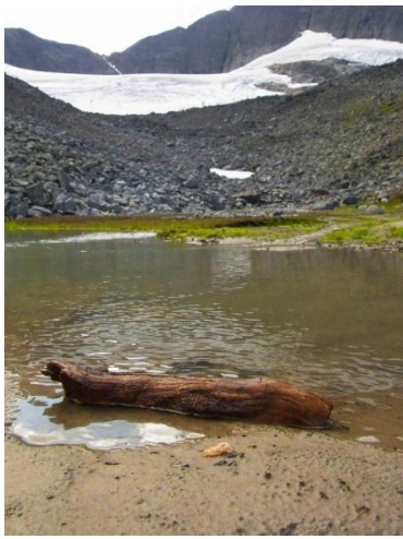
Pinus, Helagsglaciären, 1350 m a.s.l.

Photo gallery showing a representative selection of findings during summer field work 2010 in widely different parts of the Scandes. All were recovered several hundred meters above the treeline, close to the snout of receding glaciers and snow/ice patches. No datings yet available.